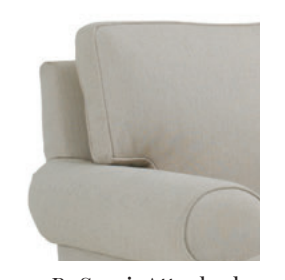
-B Semi-Attached Boxed Back