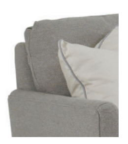
-S Semi-Attached Knife Edge Back