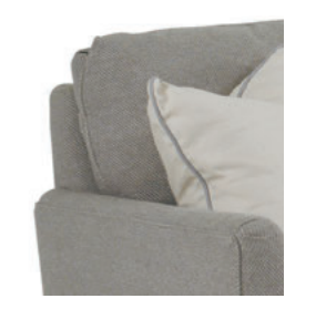
-K Loose Knife Edge Back