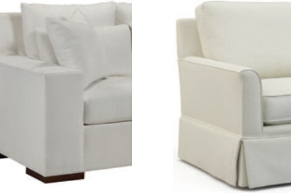
-34 Blair Wide Track Arm to the Front