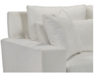
-D Loose Knife Edge Dual Bed Pillow (Only available in Luxury Depth)