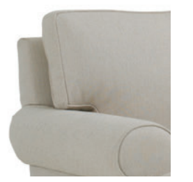
-L Loose Boxed Back