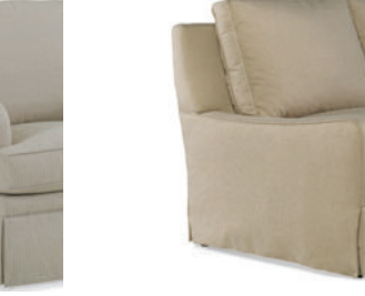
-27 Essex English Arm T-Cushion)