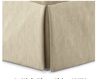
-S Kick Pleat Skirt 9¼"H